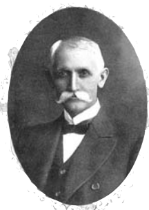
Winfield Scott Stratton struck it rich in Victor in July 1891.

While Womack's claim to a gold find in Cripple Creek was being validated, Winfield Scott Stratton prospected 6 miles away. July 4, 1891, above what was to be the town of Victor, he staked claims to the Independence and Washington mines. The news that an itinerant carpenter (Stratton) could find a paying gold mine gave new life to the tarnished reputation of Womack and the district. Stratton later sold the Independence for $11,000,000, causing an influx of British capital, confirming that the district had "arrived". The Independence Mine can be seen above Victor and is listed on the National Register of Historic Places.